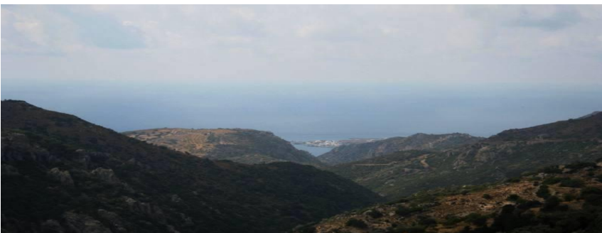
View from the Alpha Hotel Retreat, October 2011

The village of Azogires is typical of a working Cretan village with sheep and goats grazing beneath olive trees and Cretan birds of prey circling the sky. Locals go about their day to day life and settle in the Alpha Kafenion at the end of the working day. Our host at the Alpha Kafenion, where we will have our evening meals, will tell you many interesting stories about this area which has been passed down from one generation to next.