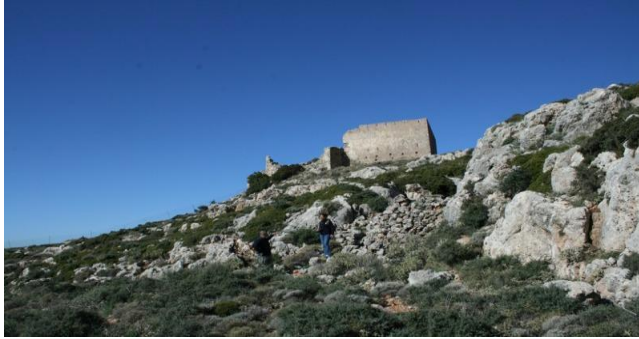
Walk from Azogires to the old Turkish fort, a good flower hunting area.